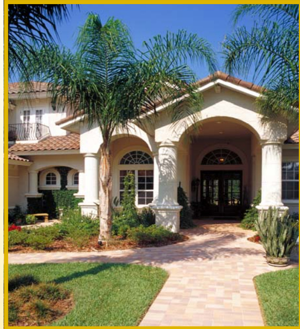
This beautiful Florida home was built with 100% concrete masonry wall construction!

This lumber size and classification represents a significant amount of wood materials currently used in Florida walls and it is understood that the downgrade will soon extend to every size and classification of Southern Pine 2 .